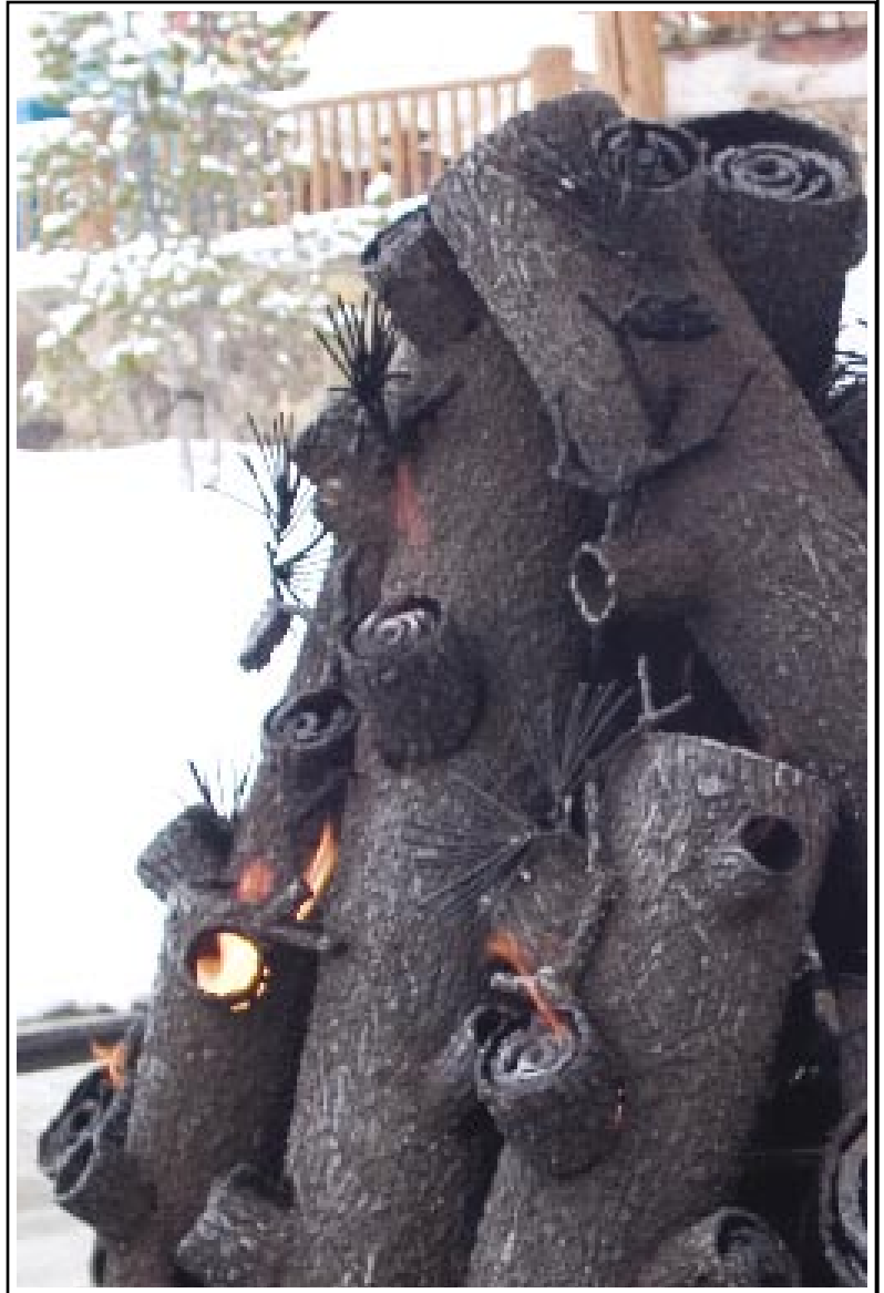
Recent installation at Copper Mountain Ski Resort, CO

For more information, call us at 970.949.5757 , e-mail to info@steelog.com , or visit our website at www.steelog.com . Give us a call—we'd love to discuss how you can have a SteelLog Artistic Metals masterpiece of your own!